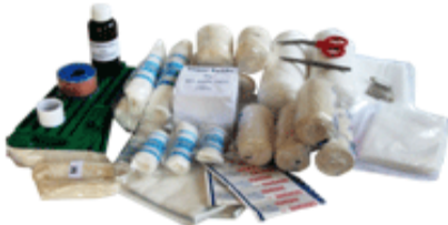
Regulation 3 kit contents only R 249.00 (inc VAT)