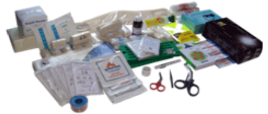
Utility kit contents only R 779.00 (inc VAT)