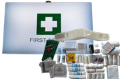
Recommended kit in a Metal Box R 728.00 (inc VAT)