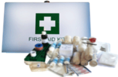
Regulation 3 kit in a Metal Box R 578.00 (inc VAT)