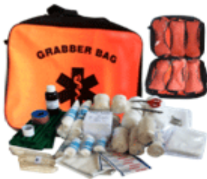
Regulation 3 kit in a Grab Bag R 468.00 (inc VAT)