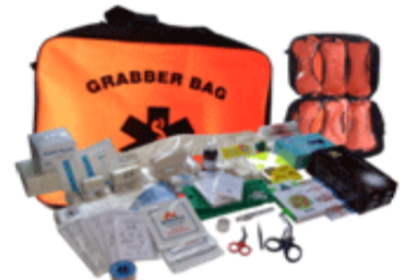
Utility kit in a Grab Bag R 998.00 (inc VAT)