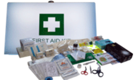
Utility kit in a Metal Box R 1148.00 (inc VAT)