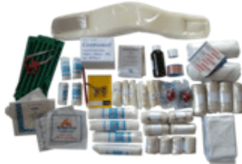
Recommended kit contents only R 359.00 (inc VAT)